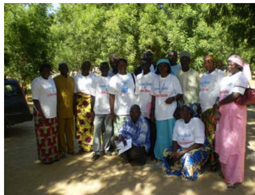
Project team with Kolofata interviewers

After the women's meeting, 11 interviewers selected for the Kolofata Sub-Division were trained on the methods of collecting information, and how to fill the data collection form. Eleven (11) communities were identified and distributed to the interviewers and two hundred (200) forms were distributed to them.