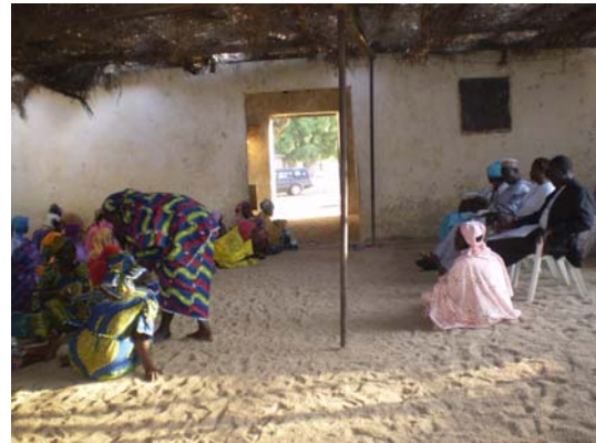
Women's meeting at the Limani chief's palace