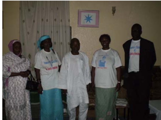
CYJULERC team meets Mayor of Mora and Counselors at mayor's residence in Mora