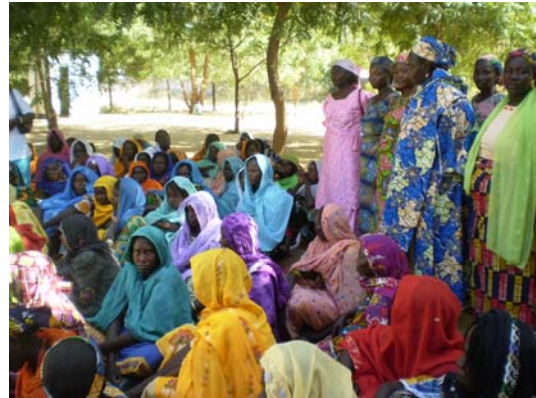
Kolofata meeting family photographs, the crowd was too large for a single photograph

After the women's meeting, 11 interviewers selected for the Kolofata Sub-Division were trained on the methods of collecting information, and how to fill the data collection form. Eleven (11) communities were identified and distributed to the interviewers and two hundred (200) forms were distributed to them.