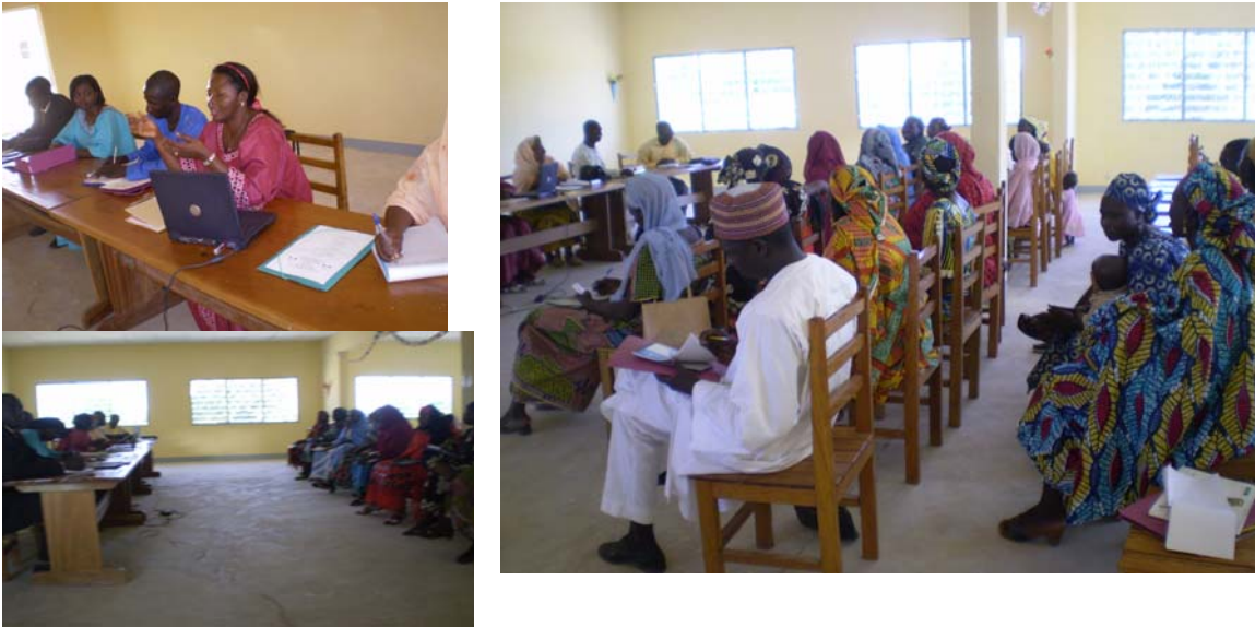
Training Seminar at Women's Empowerment Center, Mora- Mayo Sava Division

this opportunity to find out the situation of early marriage and the prevalence of fistula in the Division. She said the aim of this meeting was to discuss these three issues which cause serious problems to the health of women.