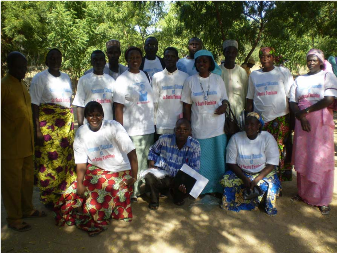
Les membres du projet de CYJULERC avec ses intervieweurs à Kolofata, L'Département de Mayo Sava la Région de l'Extrême Nord

Une recherche sur la prédominance de l'Excision et le pleduayé au près des Ministres et les Parlementaires de adopte une loi qui criminalise l'excision au Cameroun.