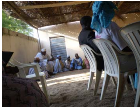
Project team discuss with Limani community head and notables