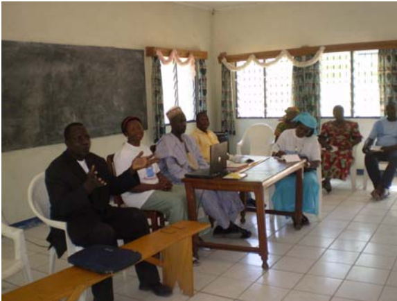
Project team at Kolofata training workshop.