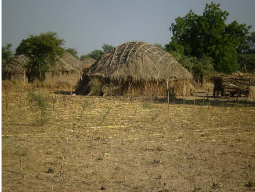
Une maison typique d'Arabe Choa à Kolofata.