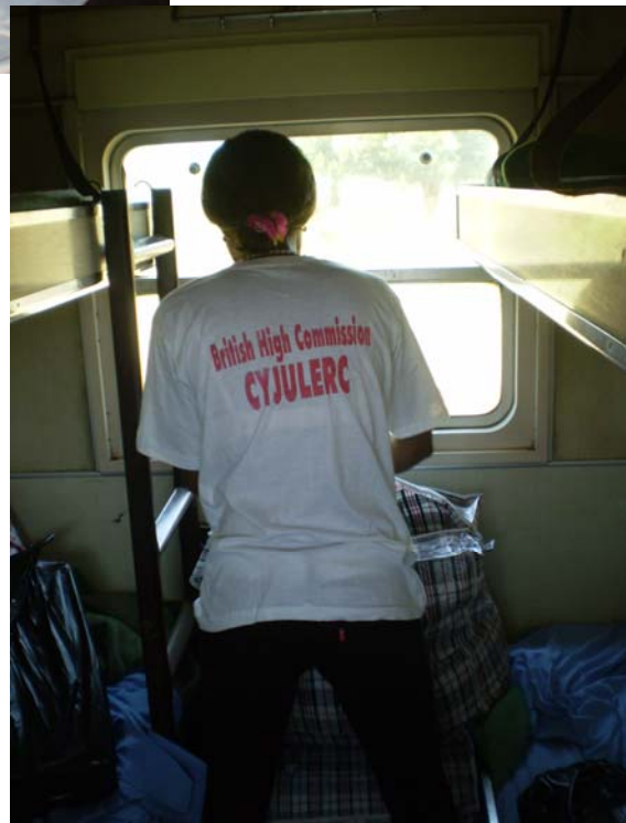
Membre de l'équipe de CYJULERC dans le train pour Ngaoundéré.