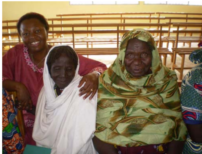
CYJULERC's National Coordinator (left) with heads of Limani and Kolofata women's group.