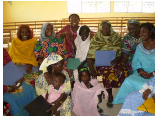
Participants at Mora workshop.

The afternoon session was to discuss the data collection form and to train the interviewers the methods they had to use during the interviews. The research methodology that was used in this project was not a standard methodology, considering that FGM is a culturally sensitive issue, any standard research methodology could not give the required results. The fact that the target communities are indigenous and illiterate also made it difficult to use the conventional method.