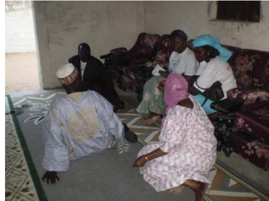
Limani community head and CYJULERC project team in the palace guest room