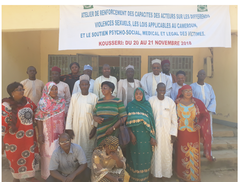
Capacity Building Workshop of Women's Rights Promoters and Stakeholders Kousseri 20 – 21, 2018