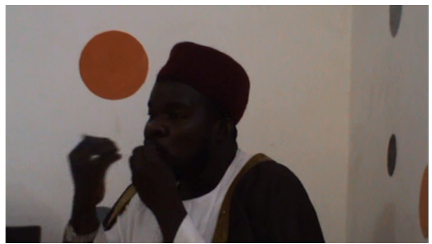
Imam explaining the position of the Muslim religion on women and the girl child sexual rights