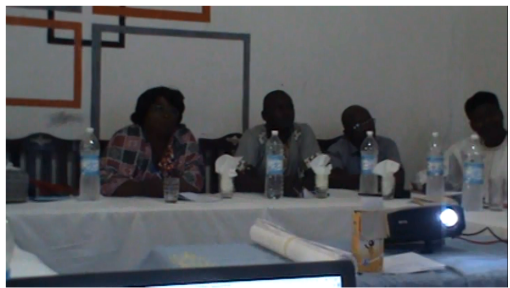
A cross section of participants