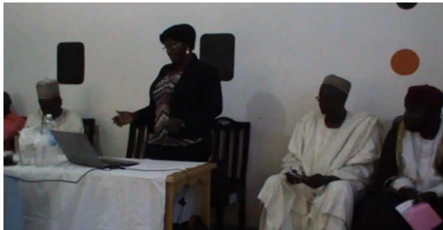
Traditional and religious heads (the Sultan's representative and the one of Imam's of Kousseri) participated.

In fact, there are no more activities to be implemented considering the short timeline of the project which will end in February 2019. Monitoring and evaluation of the project (Activity 3) is on-going and will be finalized in February before the final report.