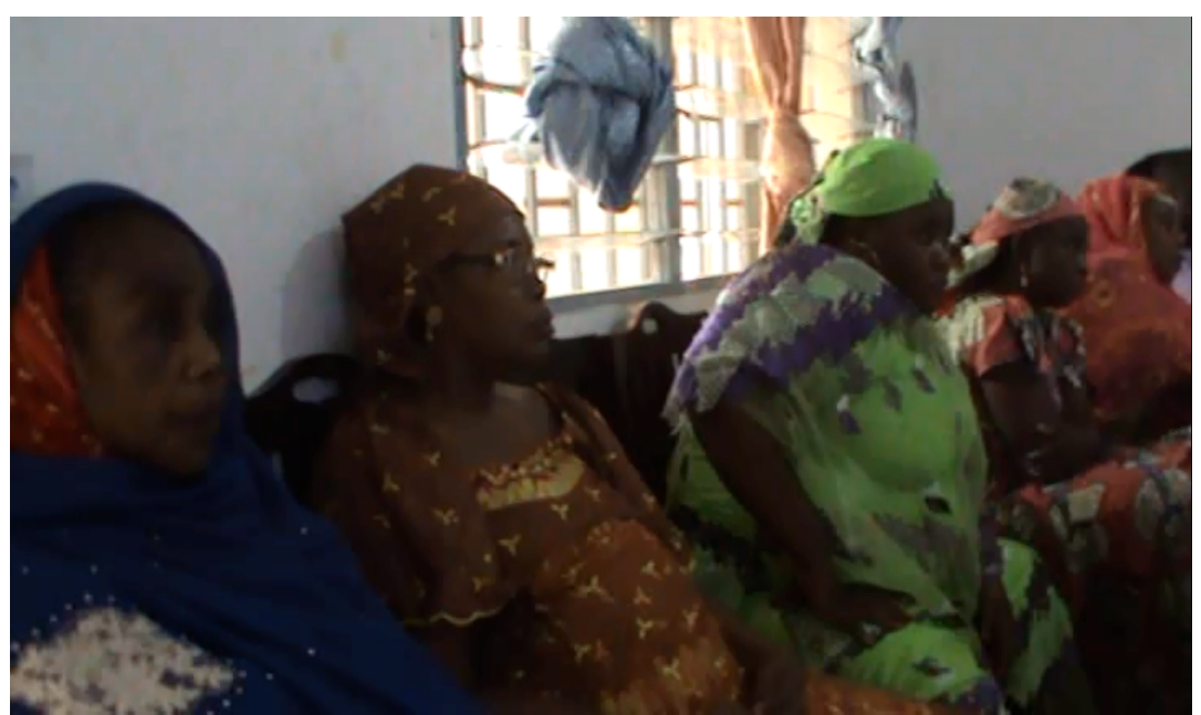
Representatives of Women's CSOs and Networks in the Far Nord Region

CYJULERC has exhausted all its funds; as such we are unable to provide financial assistance to victims for medical and legal bills, and implement the on-going monitoring and evaluation activities. We are therefore requesting for payment of our invoice attached hereto in the sum of Four million one hundred and eighty six thousand, one hundred and eighty five (4,186,185) francs CFA, to enable us give financial assistance to victims, and monitor and evaluate the project.