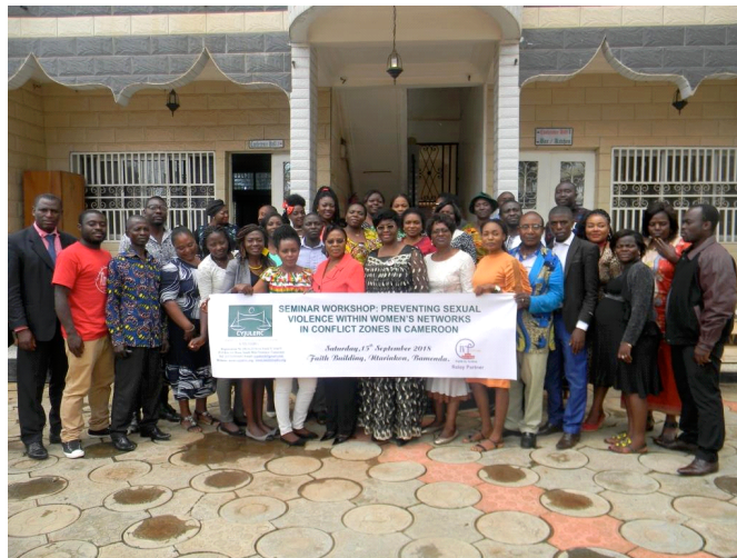
Capacity Building Workshop of women's rights promoters and stakeholders Bamenda, 14 – 15 September, 2018

Title of Project: PSVI networks in Cameroon